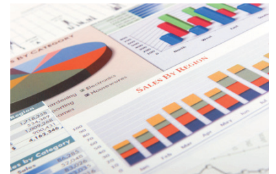
Comprehensive Reporting from any area of your business or a combination.

We have recently added scheduling functionality which allows you to automatically deliver reports directly to your management team in many different formats. Once you have decided who should get it and when, just leave the rest to InnView!